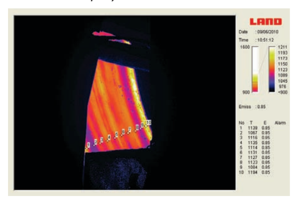
LIPS NIR - Point Measurement

Temperature measurement: point, rectangle, polygon, isotherm, histogram, area